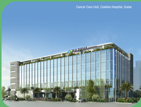
Cancer Care Unit, Zulekha Hospital, Dubai