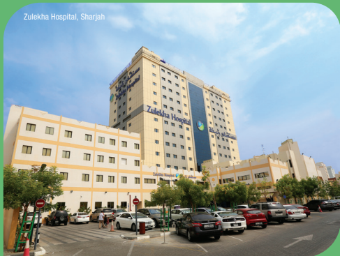
Zulekha Hospital, Sharjah