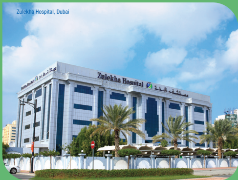
Zulekha Hospital, Dubai